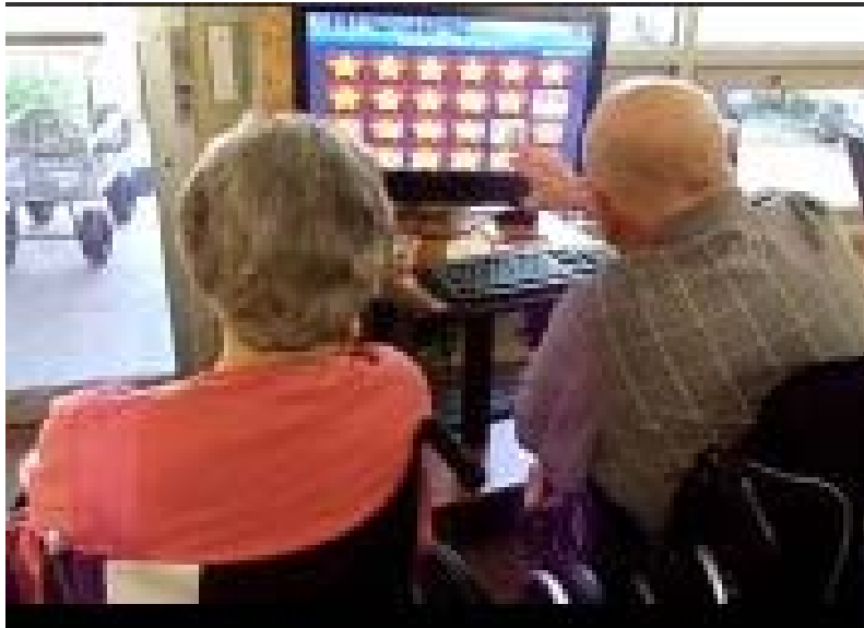
Residents enjoy a game on our Never Too Late computer system.