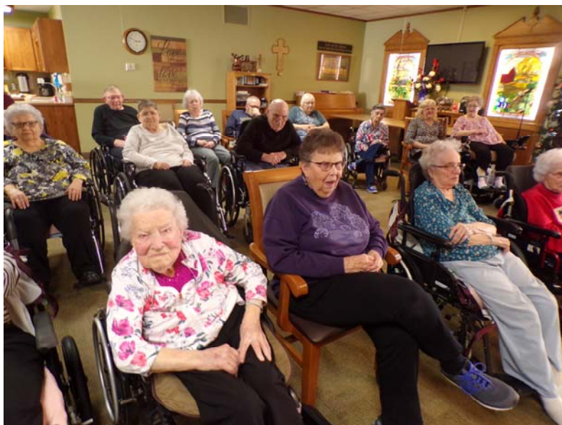
Residents and guests prepare for entertainment in the day room.