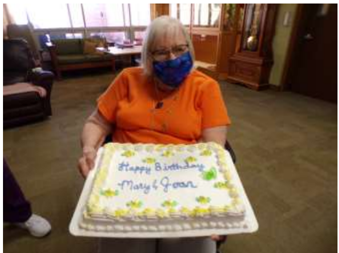
Happy birthday to — left,