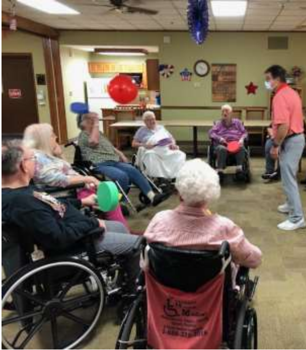
Residents play balloon tennis.