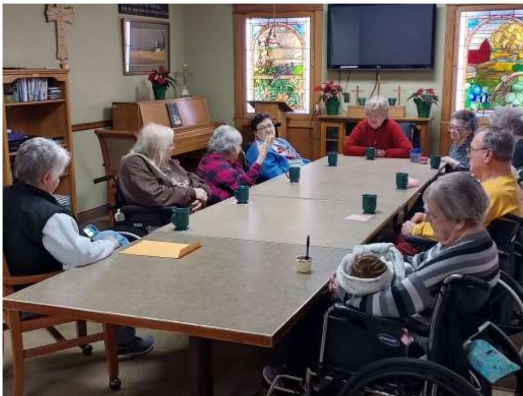
Residents enjoyed the return of Coffee with Kitty in January.

As we bid adieu for this newsletter we wish you all the best until next time!