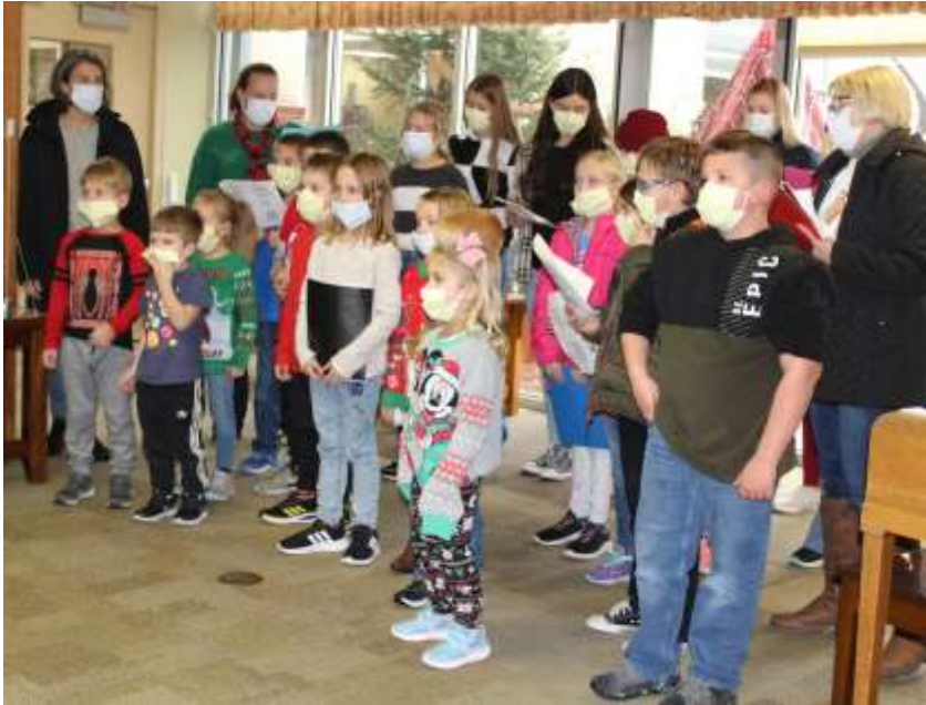
Student's and teachers from St. Paul's School in Plymouth came caroling.