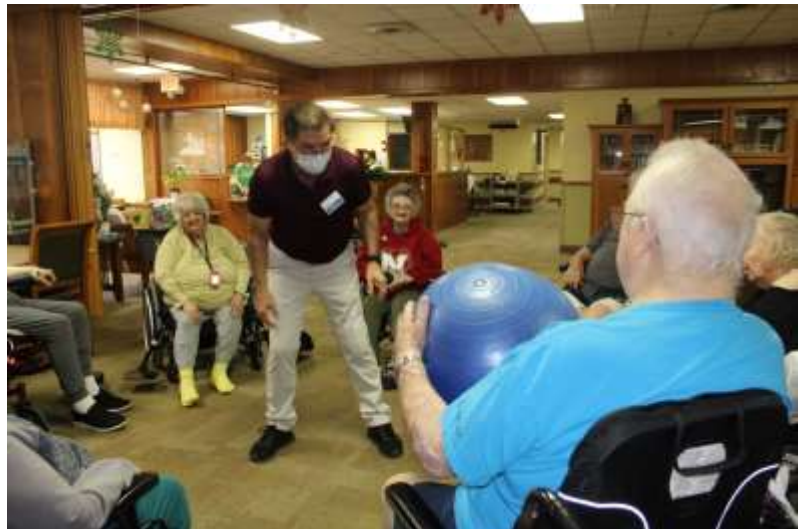
Residents enjoyed playing kickball.