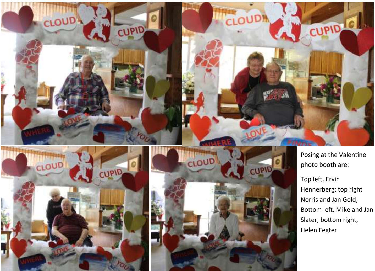
Posing at the Valentine photo booth are: