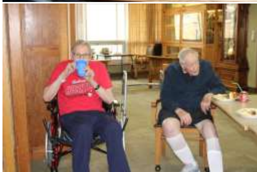
Residents and family members enjoy gathering for tailgates and Friday happy hours.