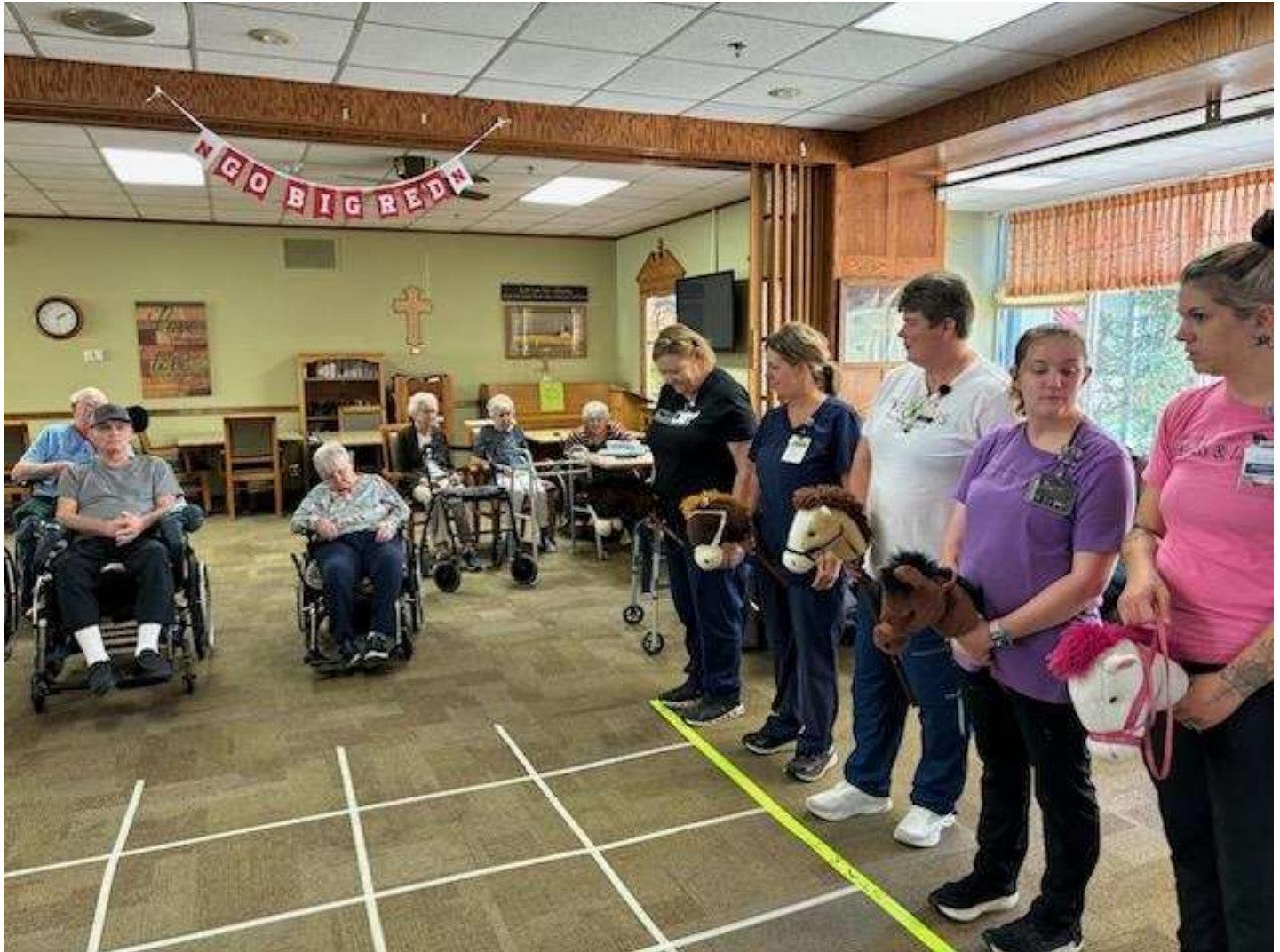
Residents and staff enjoyed an indoor stick-horse race this month.