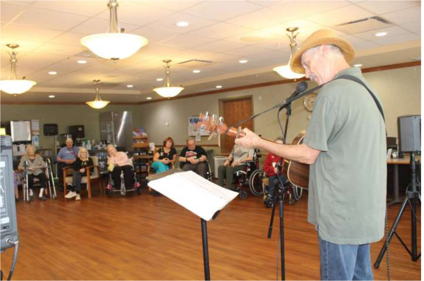
Residents enjoyed entertainers in August.