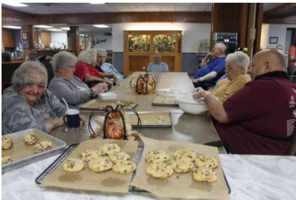
Residents baked cookies to help with a fund-raising event for Fairbury students planning a trip to Europe.