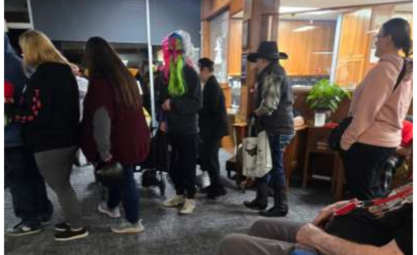
JCH&L Gardenside hosted Trick or Treaters at Gardenside on Halloween.