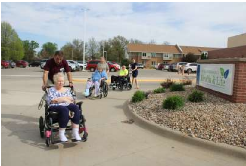
Staff and residents get some fresh air with a walk outside.