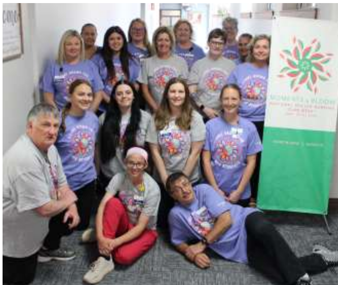
Gardenside staff posed for a group picture during Nursing Home week, showing their Moments in Bloom shirts.